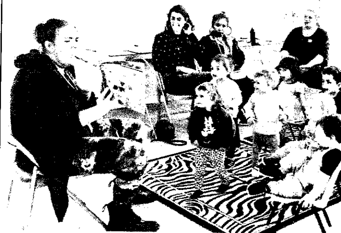
Story time: Children enjoying a picture book at the Finchley Community Toy Library