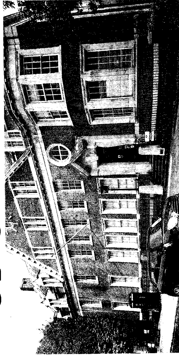
The former Hampstead Police Station, in Rosslyn Hill.

The councillors appeared to have made up their minds for reasons unconnected with planning. Despite watching the hearing in person and on the webcast, it is not clear to us what use the council would permit for this site or why it does not use its powers more to reduce traffic and air pollution, if those are the councillors' concerns.